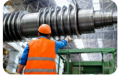
Operation and Maintenance