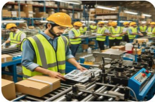
Inspection and Expediting