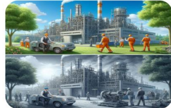
Pre Commissioning and Post Commissioning