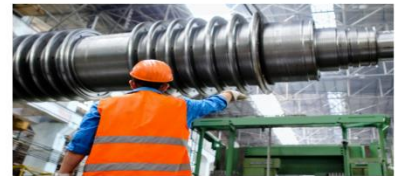
Operation & Maintenance