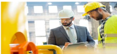
Inspection & Expediting