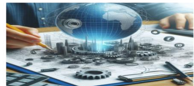
Design & Drafting