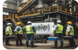
Operation and Maintenance