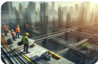
Manufacturing (Workshop & Sites) - Skilled Labour