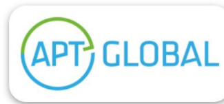
APT Global Marine Services