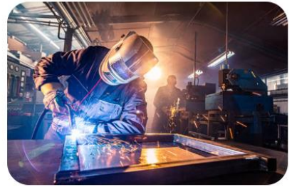
Manufacturing (Workshop & Sites) - Skilled Labour