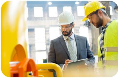
Inspection and Expediting