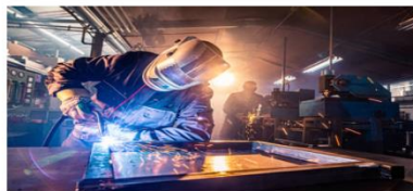
Manufacture & Fabrication